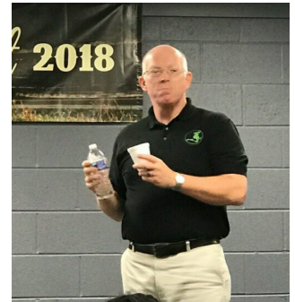
Preaching at Bill Rice Ranch

Thank you for your prayers concerning our ministry at the Bill Rice Ranch this summer. I enjoyed seeing Deaf saved in each of the four weeks as I preached and taught alongside the other ministry workers. In total there were 18 Deaf saved in the weeks I was there along with dozens of hearing young people.